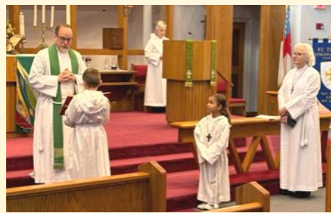
Above: Youth Sunday, February 1, 2026. The future of worship leadership looks great!