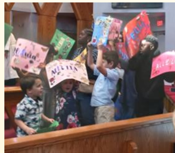
Above: Sunday School students prepared posters and “Buried the Halleluiahs” for Lent.