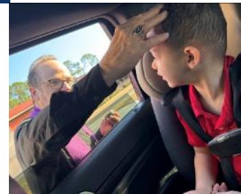
Ashes to Go, Feb. 18, 2026