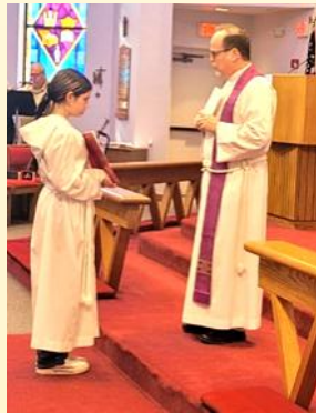
Above: Youth Sunday - March 1, 2026