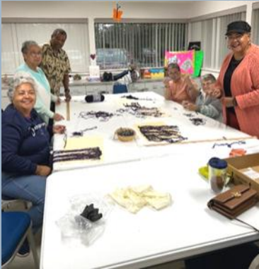
Above: It took a village of helpers to assemble nail necklaces for Lent.